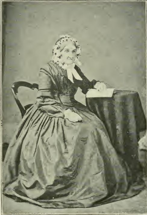
WILLIAM BOOTH'S MOTHER (Mary Moss Booth)